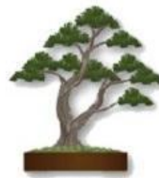
Twin Trunk "Sokan"