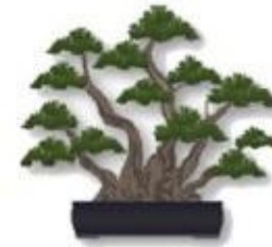
Multiple Trunk "Kabudachi"