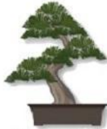
Informal Upright "Moyogi"