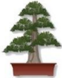
Formal Upright "Chokkan"