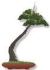
Literati or Bunjin "Bunjingi"